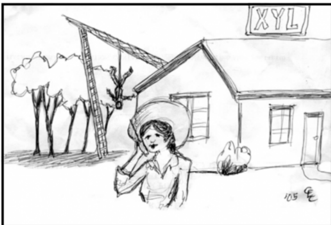
No problem! I'm sure he's hanging around here somewhere.